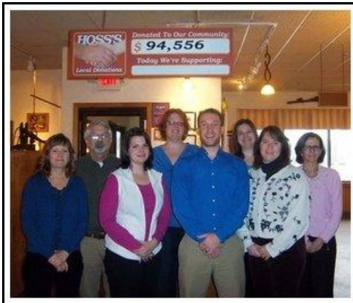
Staff from PACD and the State Conservation Commission dined at Hoss's in Camp Hill on January 26 for the Pennsylvania Envirothon fundraiser.