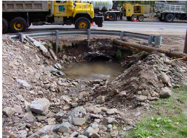
Improper road maintenance practices can be a significant source of sediment pollution

Complaints are received, assessed, investigated and resolved. We also receive, process, and review permit applications for E&S Control Plans and General and Individual NPDES permits associated with stormwater discharges. NPDES permit coverage is required for sites of 5 or more acres or (phase II) 1 acre with a point source discharge to a waterway. Permits are reviewed for administrative and technical completeness. NPDES permits now require post construction stormwater plans.