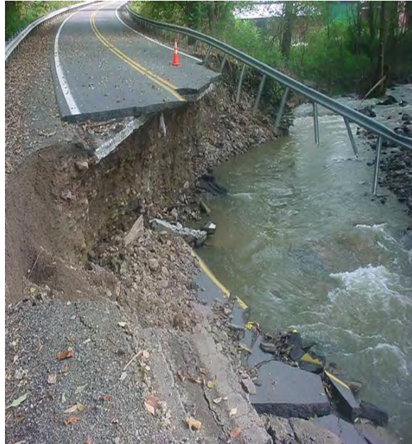
Storm damage from Hurricane Ivan