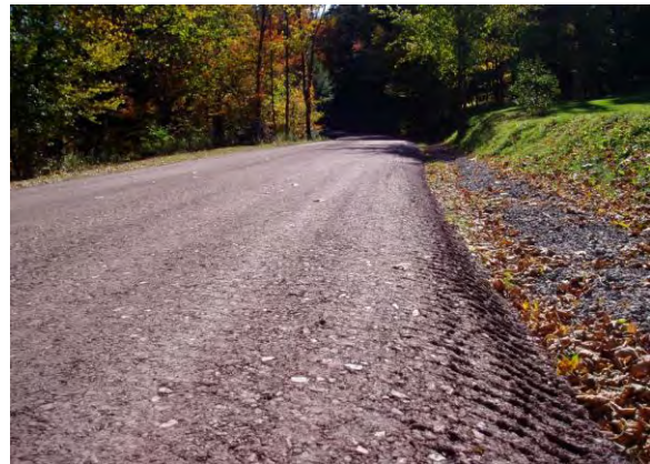
before/after – Bochnik Lane, Monroe Township