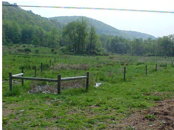
After – Spring 2004 8.4 acres of wetland protected

While there are a number of landowners that remain interested in installing more “traditional” BMPs such as storages and barnyards, demand for these types of systems is clearly diminishing in Wyoming County. The District realizes that the time to switch our emphasis to other less costly BMPs is close at hand.