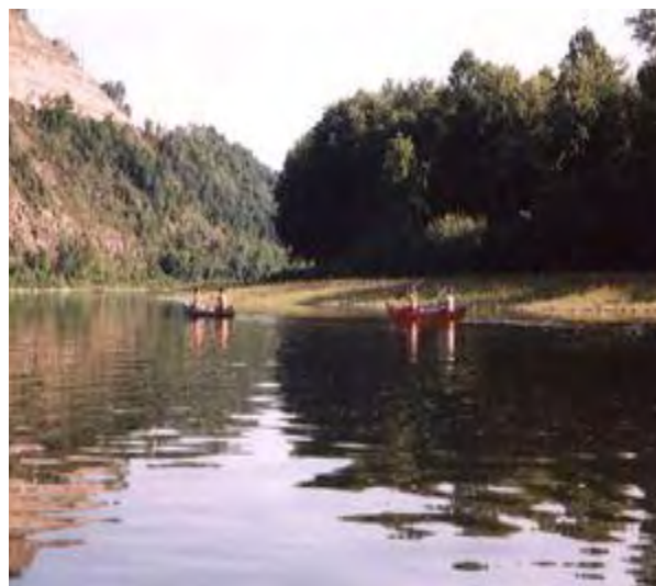
Susquehanna River Winding Through Wyoming County

Maps and additional information regarding the geography, land use, and demographics of Wyoming County can be found in the appendix.