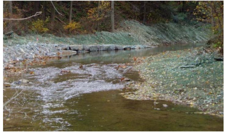
After the project was installed: new straight-vane rock structure, looking upstream. Note gently sloped and re-vegetated banks.