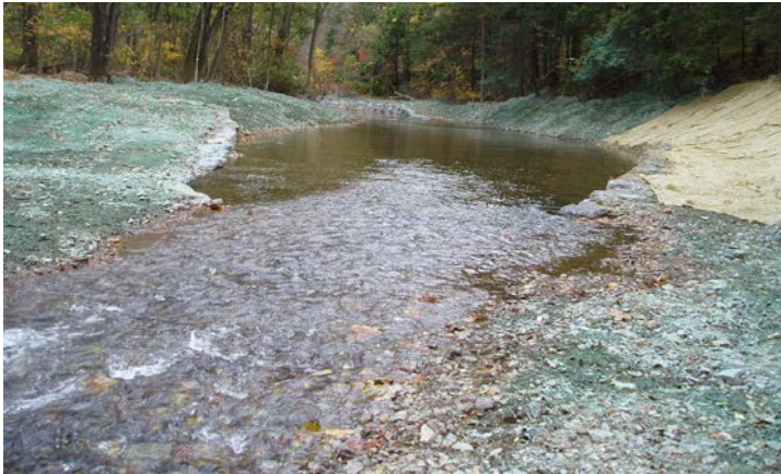
After the project was installed: a view of the cross-vane rock structure, looking downstream. Note the flow of water through the middle of the channel and away from the banks.

Located in Valley Township, Montour County, Pennsylvania, this Streambank Restoration Project restored 800 linear feet of a portion of the Mahoning Creek, a tributary to the Susquehanna River, joining in the borough of Danville.