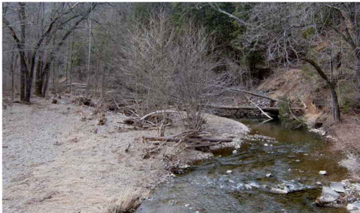
Before the project was installed: a view of Mahoning Creek. Note the steep eroded banks where trees had fallen into the creek. A large gravel bar had also formed in the middle of the creek due to sediment accumulation.