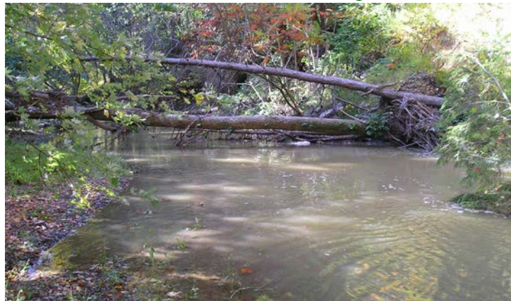
Before the project was installed: erosion on the steep bank threatened to collapse the road & bike path above the Creek.