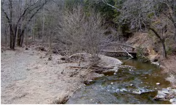
Before the project was installed: a view of Mahoning Creek. Note the steep eroded banks where trees had fallen into the creek. A large gravel bar had also formed in the middle of the creek due to sediment accumulation.