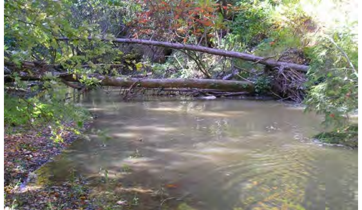
Before the project was installed: erosion on the steep bank threatened to collapse the road & bike path above the Creek.