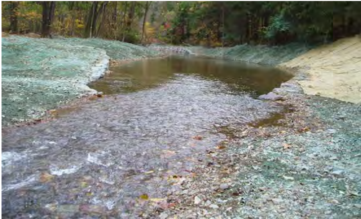
After the project was installed: a view of the cross-vane rock structure, looking downstream. Note the flow of water through the middle of the channel and away from the banks.

Located in Valley Township, Montour County, Pennsylvania, this Streambank Restoration Project restored 800 linear feet of a portion of the Mahoning Creek, a tributary to the Susquehanna River, joining in the borough of Danville.