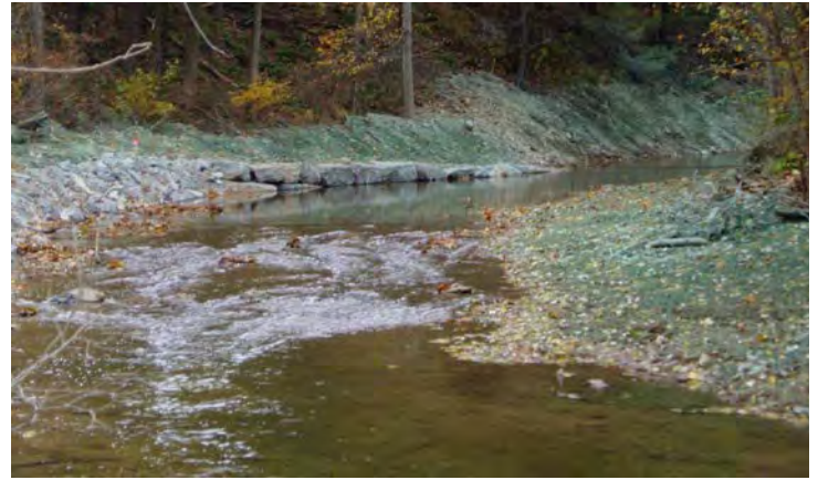
After the project was installed: new straight-vane rock structure, looking upstream. Note gently sloped and re-vegetated banks.