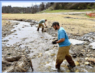
Nixon Park Stream and Riparian Buffer Restoration