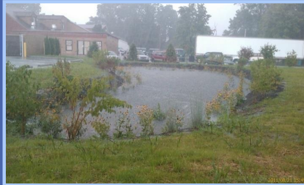
Rain Garden at Rite Aid, Springettsbury Township

BMP, or best management practice, describes both structural or engineered control devices and systems (e.g. retention ponds) to treat polluted stormwater, as well as operational or procedural practices (e.g. minimizing use of chemical fertilizers and pesticides).