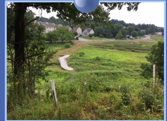
Nixon Park Stream and Riparian Buffer Restoration

Financial and other support for this project is provided by the Pennsylvania Association of Conservation Districts, Inc. through a grant from the Pennsylvania Department of Environmental Protection under Section 319 of the Clean Water Act, administered by the U.S. Environmental Protection Agency.