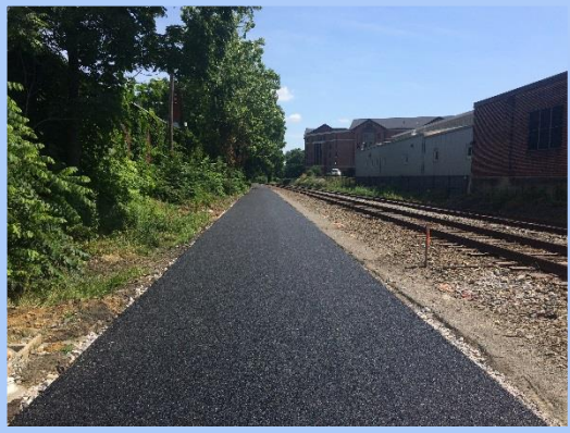
Pervious Pavement, Rail Trail York City