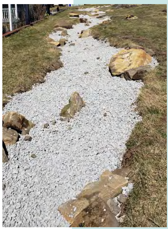
Dry Creek at the South Side Community Garden , New Castle, PA