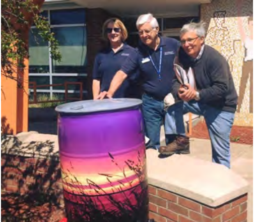
Erie County Conservation District's rain barrel decorating contest winner.

Rain barrels are containers that collect and store rain water from roofs and downspouts for future use. Water collected reduces runoff and water pollution, helps recharge groundwater, lowers your water bill, and conserves water.