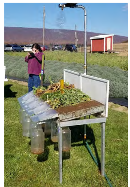
Bottom Right Photo: Rainfall simulator demonstration running.