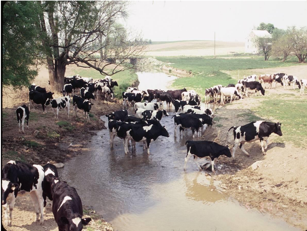
Caption #3: Before: The trampled stream bank led to lots of dirt and pollution in the stream.