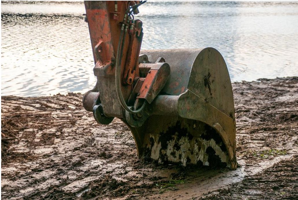
Caption #2: During: Work in progress by contractors xyz123