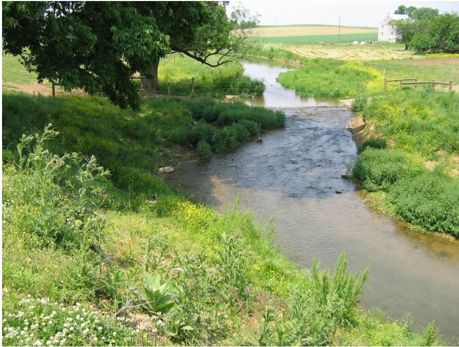
Caption #1: After: The restored stream. Beautiful!