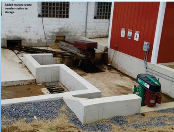
Added manure waste transfer station to storage.