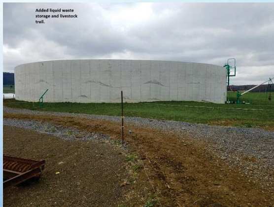
Added liquid waste storage and livestock trail.